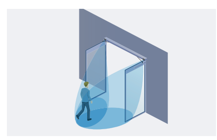
Double swing doors